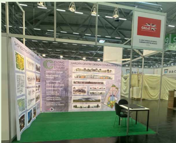
Examples of stand design